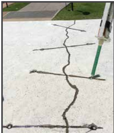
SINGLE BLADE WIDTH

The Concrete Crack Lock® is installed by making a single blade saw cut in the concrete across the crack and then drilling two small holes at each end. The cut is then filled with Rhino High Strength Epoxy Paste, and the Concrete Crack Lock® is inserted. The Concrete Crack Lock® requires less concrete removal and epoxy than other similar crack repair products, thus saving time on installation.